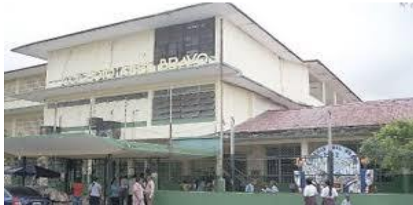
Abel Bravo School Province of Colón