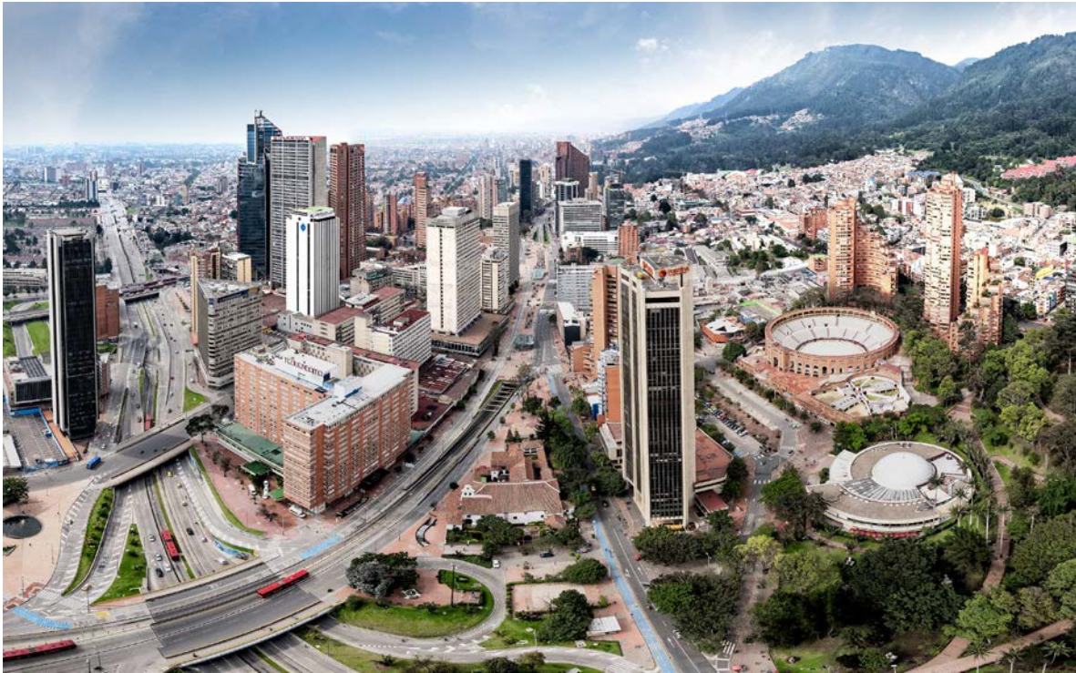
Panoramic photograph of Bogota 2019

Bogota is the capital and largest city of Colombia. It is a point of convergence for people from all over the country, so it is diverse and multicultural, combining the old and the modern.